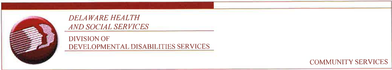
Exhibit B - HRC Confidentiality Statement