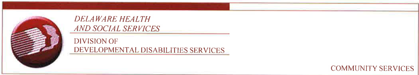
Exhibit C - DDDS HIPAA and Confidentiality Policy Acknowledgement