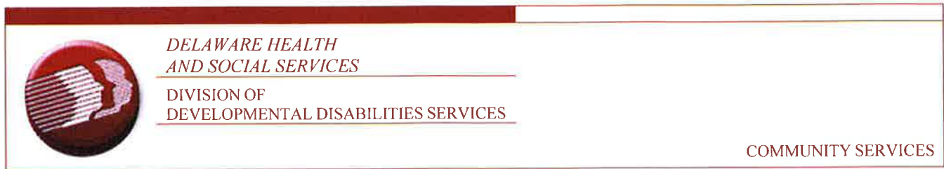
Exhibit A - HRC Conflict of Interest Policy and Disclosure Form