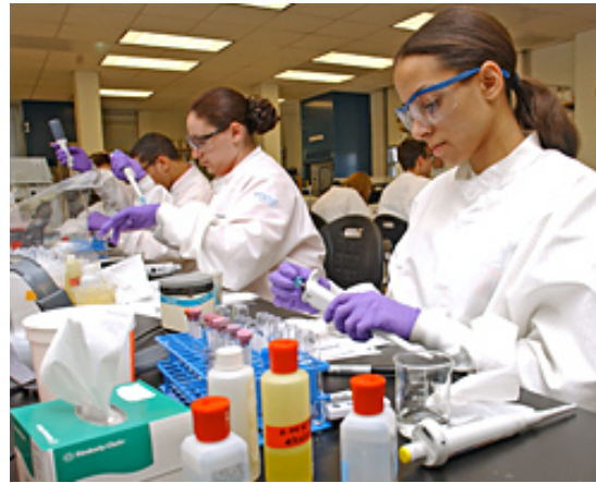
Medical Laboratory Sciences