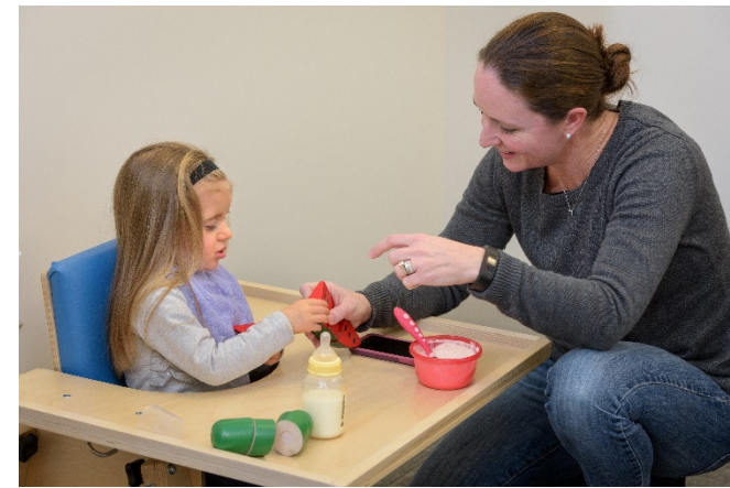
Communications Sciences & Disorders