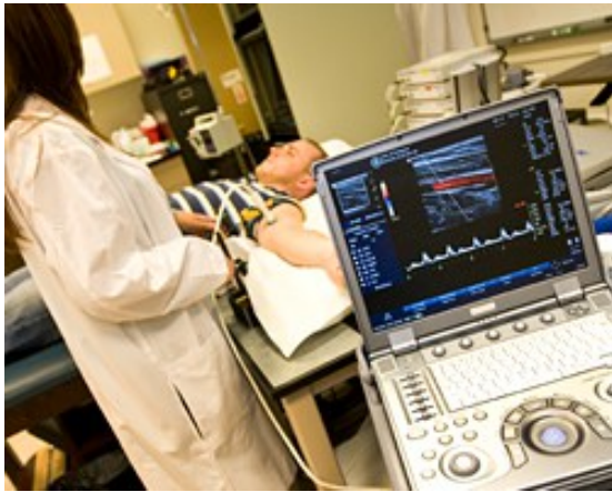
Kinesiology & Applied Physiology