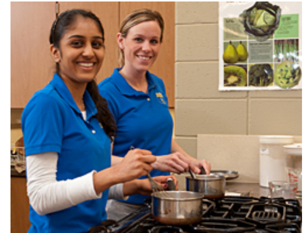
Behavioral Health & Nutrition