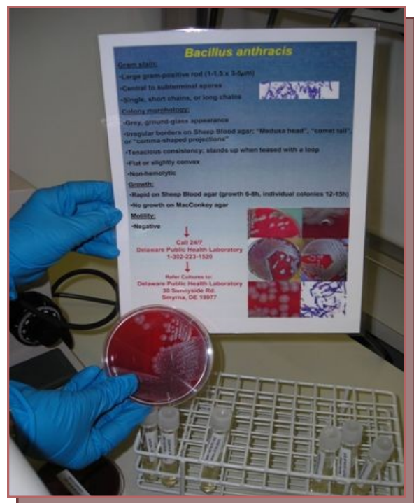
BT Sentinel Laboratory Guidelines