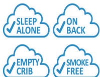
Figure 1. Four Key Safe Sleep Messages

In partnership with the Delaware Healthy Mother and Infant Consortium, Delaware has launched the Long Live Dreams safe sleep campaign to promote safe sleep practices focused on four key messages: