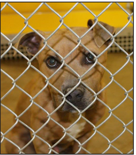
Lily is one of the dogs looking for her forever home at the BVSPCA New Castle shelter.

For information on how to adopt any of the animals pictured here, visit <a href="http://bvspca.org">http://bvspca.org</a>, call 302-516-1000, or stop by the BVSPCA New Castle shelter during their business hours.