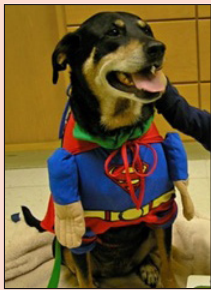
Pictured here are two dogs enjoying their one-on-one visits with people as part of the PAWS for People pet therapy program. Cats and rabbits can also volunteer with their owners to provide therapeutic visits for those who can benefit from interaction with an animal.