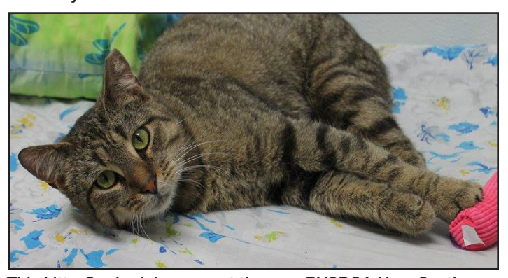
This kitty, Squirrel, lounges at the new BVSPCA New Castle Shelter while waiting to be adopted.