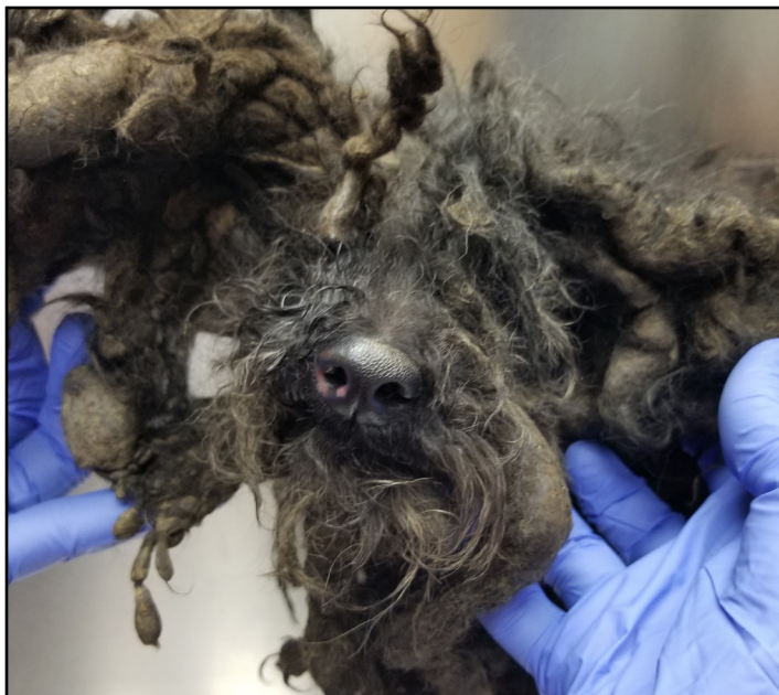
Turtle, one of the dogs rescued from animal cruelty in Seaford, is shown just after his rescue and after his matted fur was shaved.

The surviving animals were taken to the Brandywine Valley