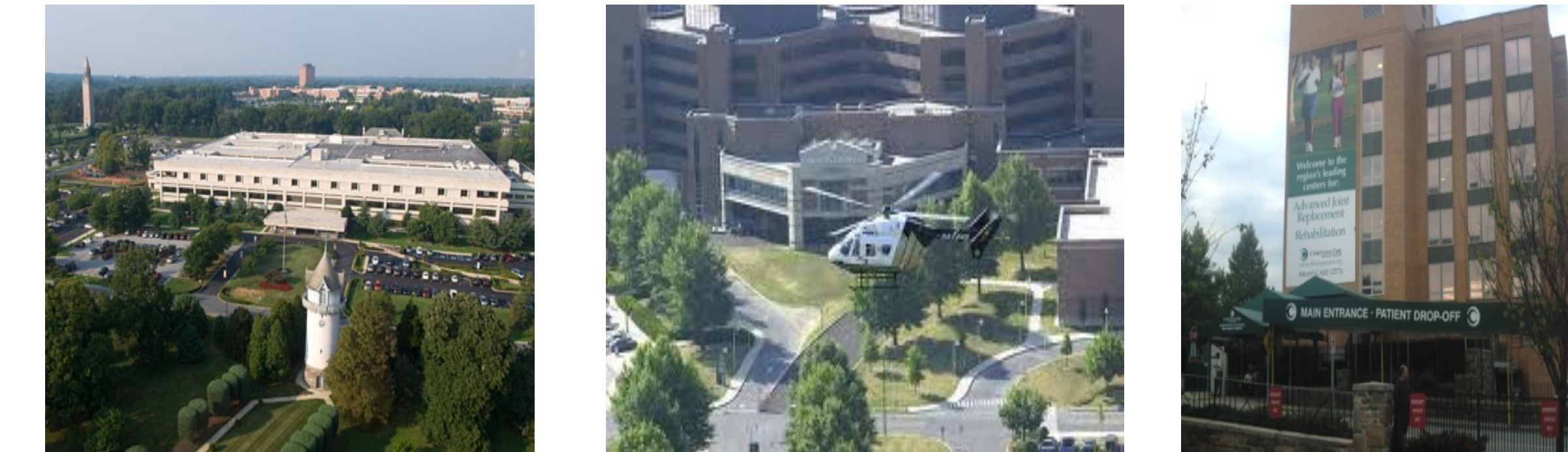
Above, left to right: A. I. du Pont Hospital for Children (I) 180 beds, Christiana Hospital (II), 808 beds & Wilmington Hospital (III), 258 beds.