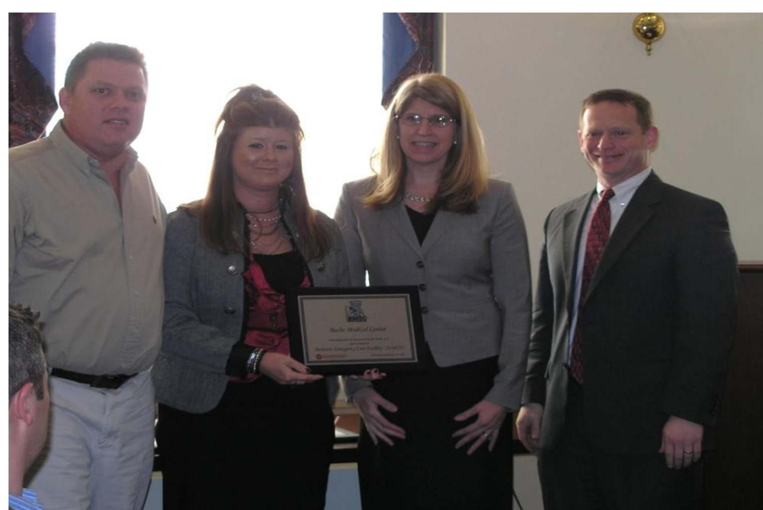
Representatives from Beebe Medical Center, Level III