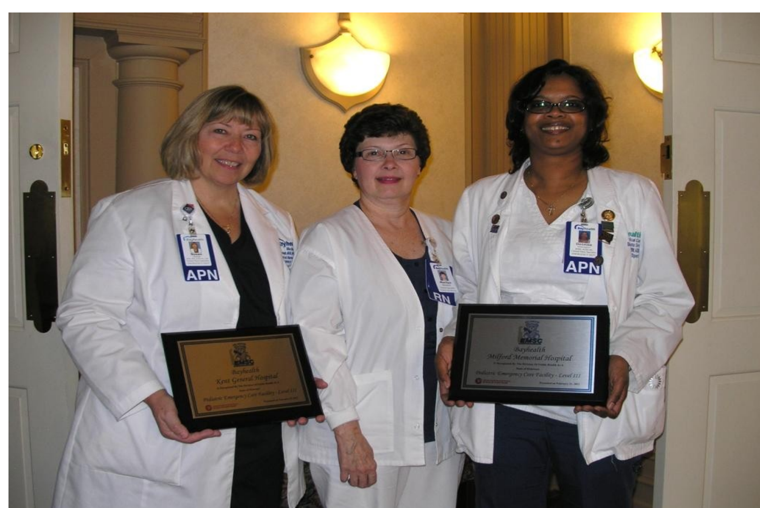
Representatives from Bayhealth Kent General and Milford Hospitals, Level III