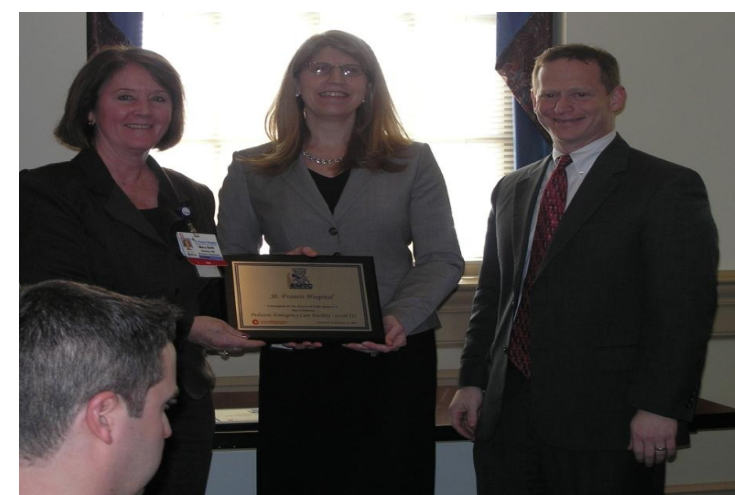
Representatives from St. Francis Hospital, Level III