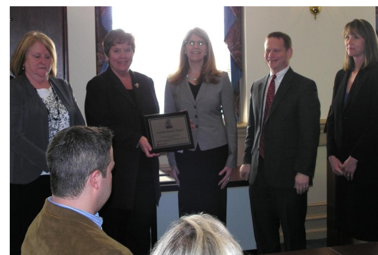
Representatives from Nanticoke Memorial Hospital, Level III