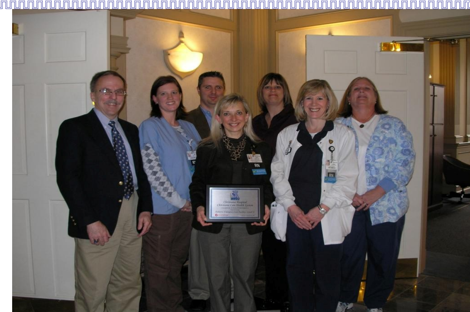
Representatives from Christiana Care Health System, Level II and III