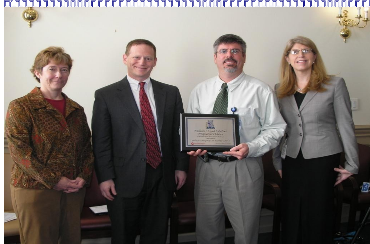
Representatives from A.I. du Pont Hospital for Children, Wilmington, Level I