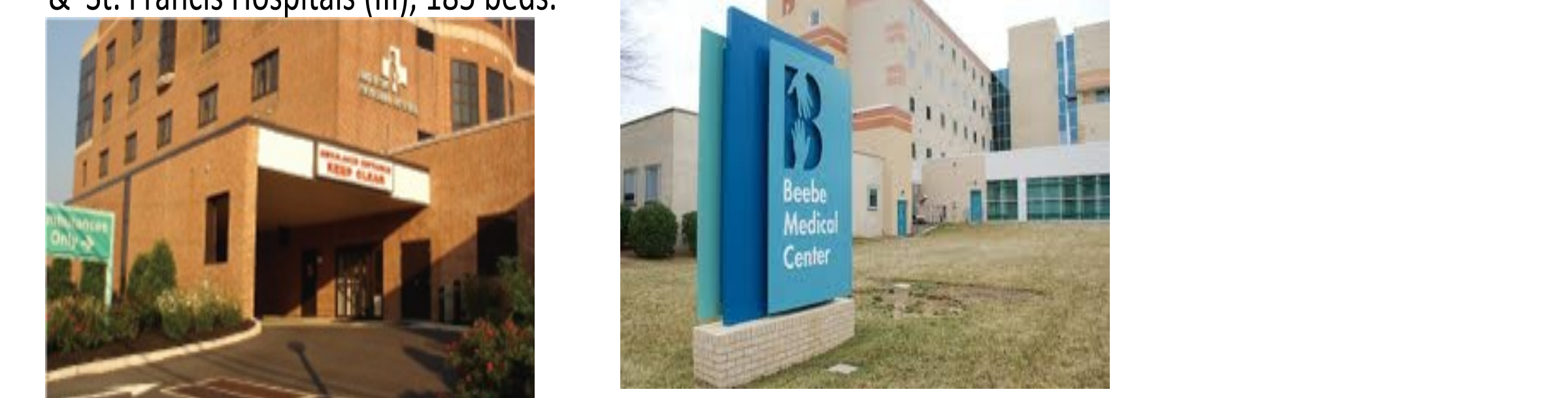
Bottom, left to right: Nanticoke Memorial Hospital (III), 98 beds, & Beebe Medical Center (III), 155 beds.