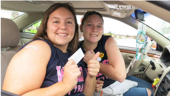
These Wesley College students got their 2016 flu shots at the Division of Public Health's drive-thru flu clinic in Dover.