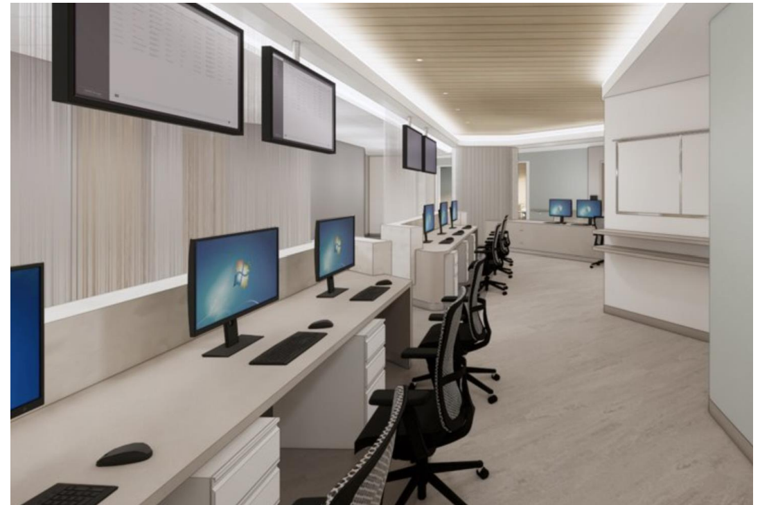
Staff Work Area