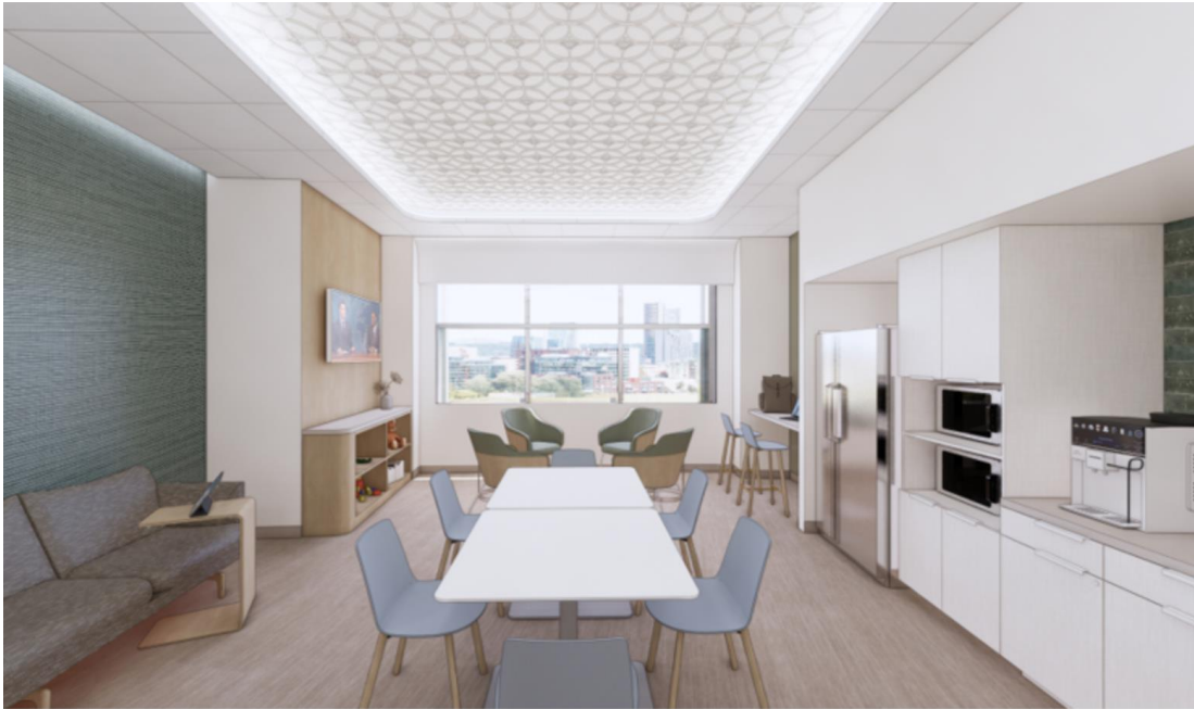
Family Nourishment and Support