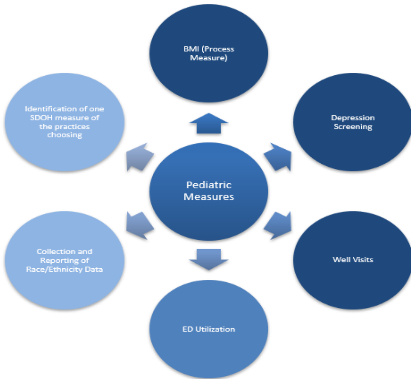
Figure 2: The dark-blue circles represent clinical measures, medium-blue represents utilization measures, and light-blue represents SDOH measures