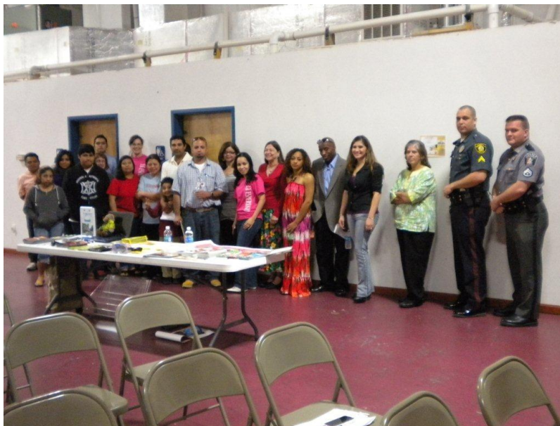
Participants of the La Esperanza Town Hall Meeting Against Underage Drinking gather to take a photo together.