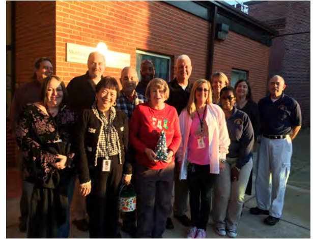
In December, the DSAMH Employee Recognition Council hosted two holiday potluck celebrations. One in New Castle County and one in Sussex County. Pictured here are attendees of the Sussex County celebration in Ellendale!