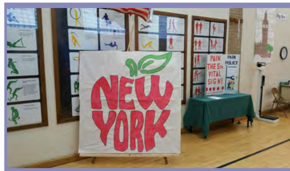
Plenty of artwork was on display highlighting the "World of Learning" theme.

In October, the Delaware Psychiatric Center held its 2015 Annual Update and Annual Review. This year's event, themed "World of Learning", allowed staff the opportunity to review presentations and display's on hospital-related information regarding safety practices and policies, as well as providing a forum for nursing staff to demonstrate competencies.