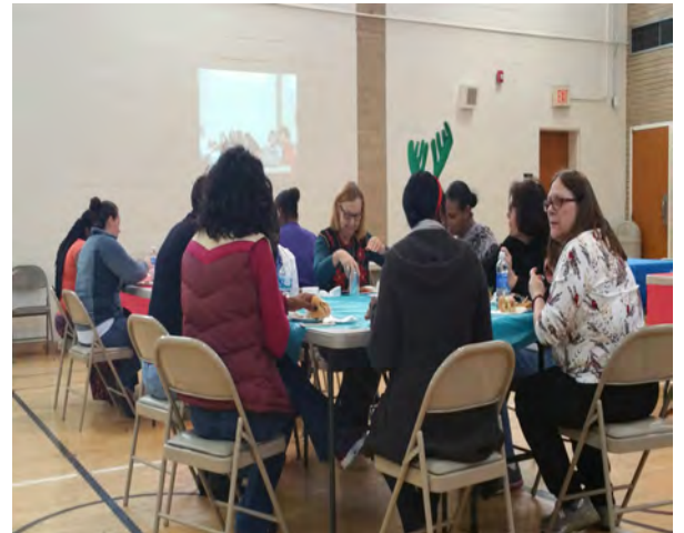
DSAMH staff are pictured here enjoying some food and fun at the New Castle County Celebration!