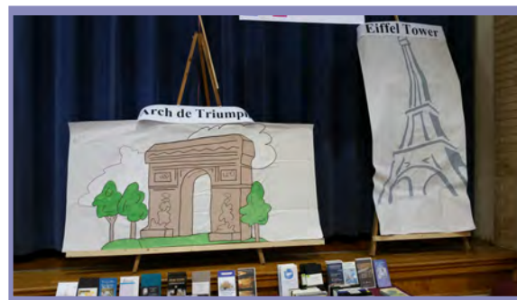
Pictured above in the "France" section are paintings of the Eiffel Tower and Arc de Triomphe located in Paris.