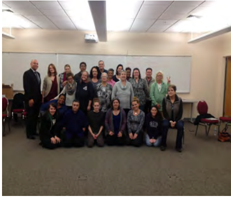
Over 20 people from Delaware participated in the Hearing Voices facilitator training in December.

In November, The National Hearing Voices Network, in collaboration with the Mental Health Association of Delaware trained over 20 facilitators for new Hearing Voices Support groups in Delaware. Hearing Voices groups originated in Europe and there are now hundreds of groups in 30 countries around the world. The network continues to grow with Delaware being one of the newest additions. The Mental Health Association of Delaware plans to debut Hearing Voices Support Groups in 2016. For more information please call (302) 654-6833. To view the recent News Journal article about hearing voices support groups, copy and paste the following link: http://www.delawareonline.com/story/news/health/2016/01/04/delaware-voice-hearers-support-group/77799774/ .