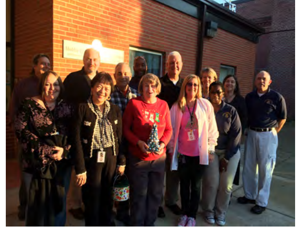
In December, the DSAMH Employee Recognition Council hosted two holiday potluck celebrations. One in New Castle County and one in Sussex County. Pictured here are attendees of the Sussex County celebration in Ellendale!