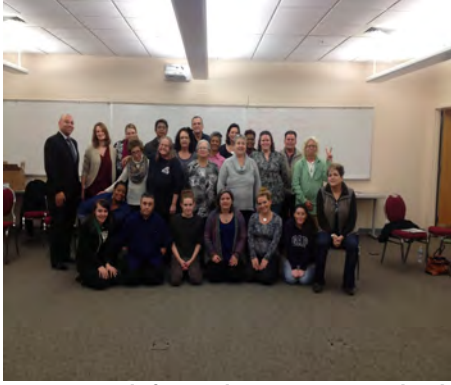
Over 20 people from Delaware participated in the Hearing Voices facilitator training in December.

In November, The National Hearing Voices Network, in collaboration with the Mental Health Association of Delaware trained over 20 facilitators for new Hearing Voices Support groups in Delaware. Hearing Voices groups originated in Europe and there are now hundreds of groups in 30 countries around the world. The network continues to grow with Delaware being one of the newest additions. The Mental Health Association of Delaware plans to debut Hearing Voices Support Groups in 2016. For more information please call (302) 654-6833. To view the recent News Journal article about hearing voices support groups, copy and paste the following link: http://www.delawareonline.com/story/news/health/2016/01/04/delaware-voice-hearers-support-group/77799774/ .