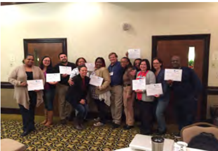
Participants from the most recent Delaware Overdose Survival Education (DOSE) training.

In December, the newest group of statewide DOSE trainers completed a three-day Train the