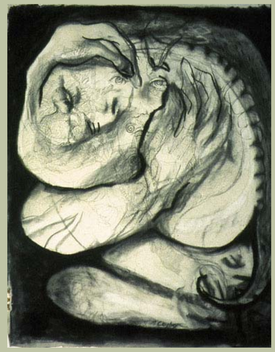
Meghan Caughey - "Hugging Form"