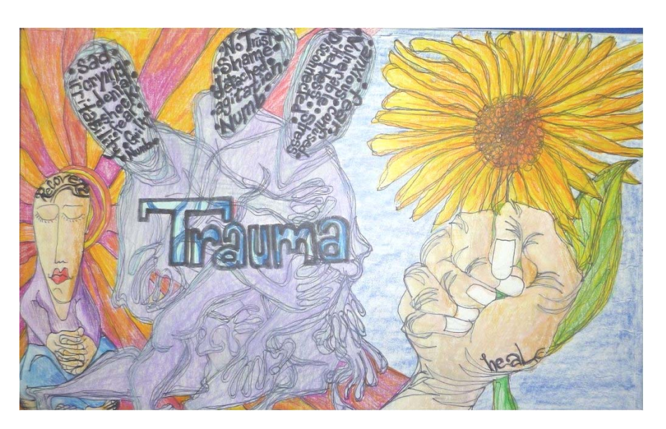
Artist: Sybil Noble, Kansas City, MO

Trauma is the experience of physical or emotional abuse, sexual abuse, abandonment or neglect, war experiences, or having been in a tornado, flood or other disaster.