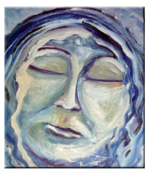
Artist: Ken Segal, DE - "Sorrow 2"

When trauma becomes disabling it impacts your feelings, your thoughts, and your ability to manage your life. It can especially affect how you deal with stressful events.