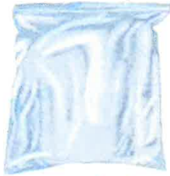
Sealed Plastic Bag