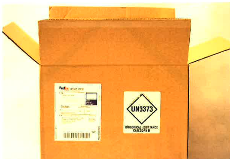
University of New Hampshire https://nhvdl.unh.edu/sending-specimens