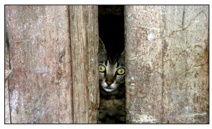
Cats that go missing don't travel far on their own. Many displaced cats will silently hide within a few houses or blocks from their home and won't respond to any human, including those they are familiar with, due to fear. If a cat goes missing, make sure to check under houses, decks, porches, bushes, and any other place they could crawl.

Animal shelters do not provide this information because they are not trained in this new information. MPP is working to provide training in lost pet behavior to animal shelter staff and volunteers.