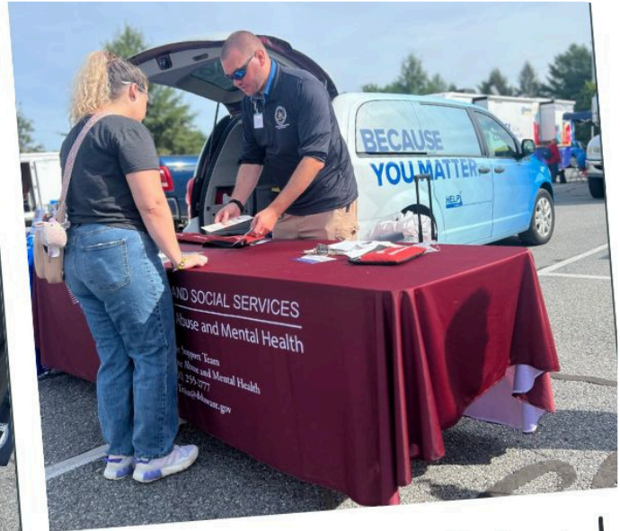
Narcan Rescue Kit Tutorial