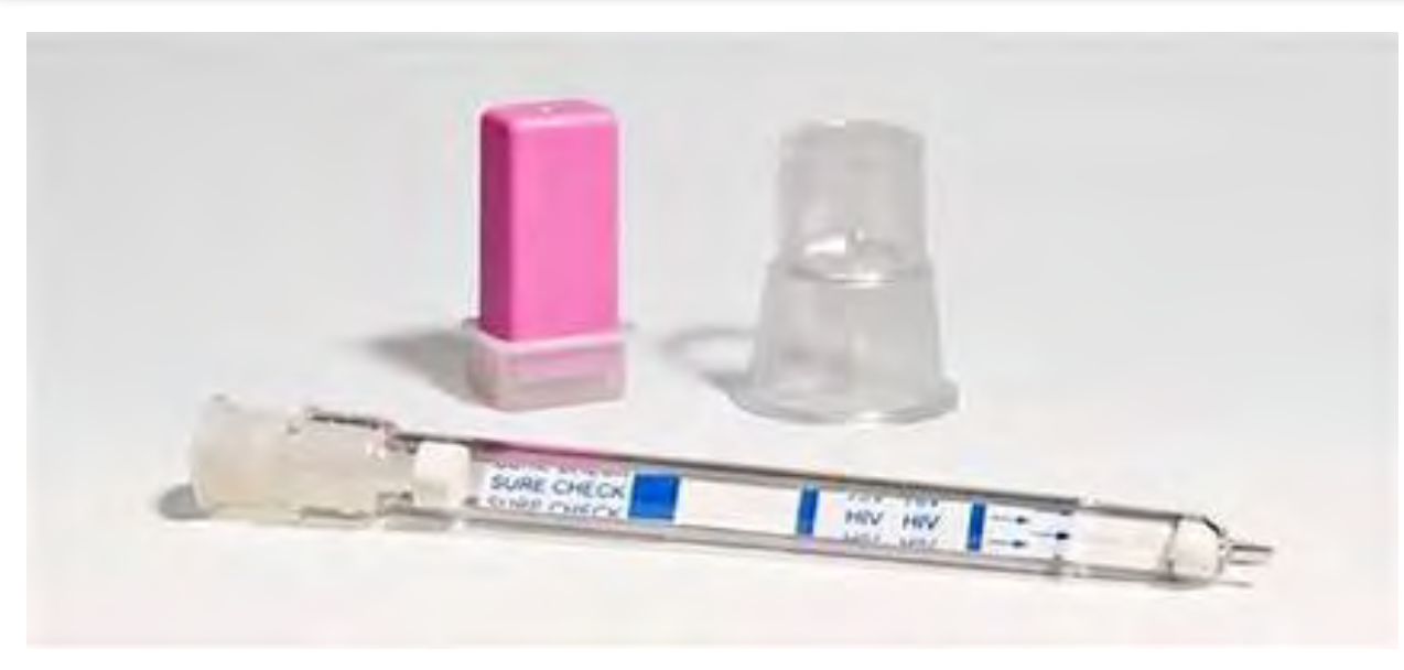
Figure 2. Sure Check Test

From a historic perspective, over the sixteen (16) years in which the Division of Public Health HIV Program has provided rapid HIV 1/2 testing to the citizens of Delaware, many changes and improvements have been made. The state used the Oraquick® test until October 2007, when DPH transitioned to the Uni-Gold test. In 2014, the State began to use the CDC rapid-rapid test algorithm for Point of Care settings. In this algorithm, an initial positive rapid test is immediately followed by a second rapid test that is provided by a different manufacturer, both being third generation tests. If both tests result as Presumptive Positives, the patient is considered to be a Preliminary Positive for HIV and is referred for follow-up care. DPH uses the Trinity Uni-Gold™ and Chembio Sure Check® rapid HIV test kits for our testing algorithm.